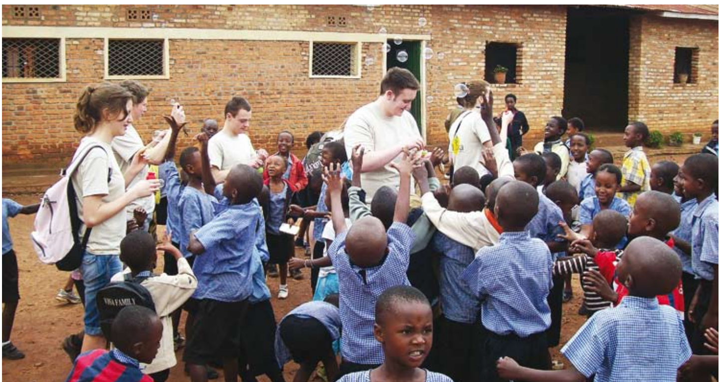
Students from Shaftesbury School during the sports day they organised at the Excel Bilingual School in Rwamagana

The visit by the Grange School, Christchurch, is to take place in August this year and Sturminster Newton High School will be joining the programme in 2011; it goes from strength to strength!