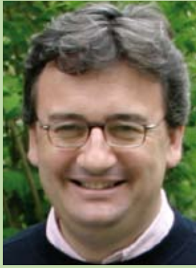
Fergal Keane Msaada founder

Msaada was established with the support of journalist and broadcaster